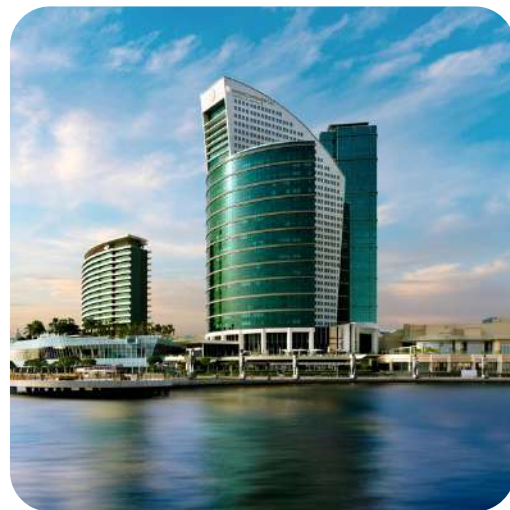
InterContinental Hotels & Resorts, Dubai, UAE

Wooden door panels, melamine faced boards, HPL (made in Germany)