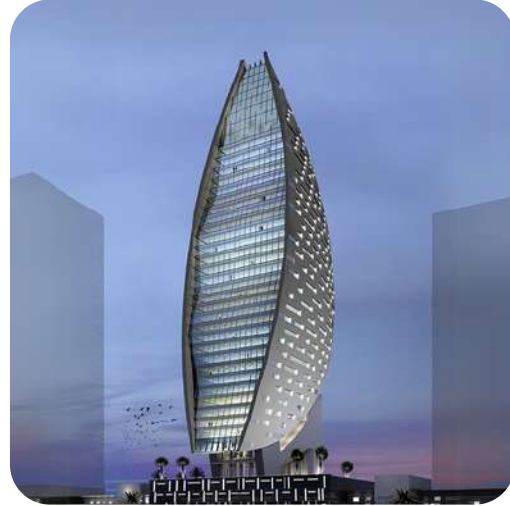
Iris Bay Tower, Dubai, UAE

Drywall construction machines (made in Austria)