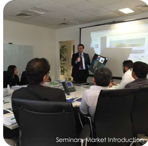
Seminars, Market Introduction

This approach enables us to deliver tailored solutions that tackle regional market challenges. From go-to-market strategies to identifying key sales channels and executing targeted campaigns, our structured framework ensures clients achieve sustainable success.