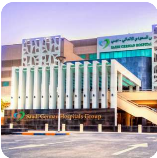
Saudi German Hospital, Al Ain & Dubai, UAE

Wooden door panels, melamine faced boards, HPL (made in Germany)