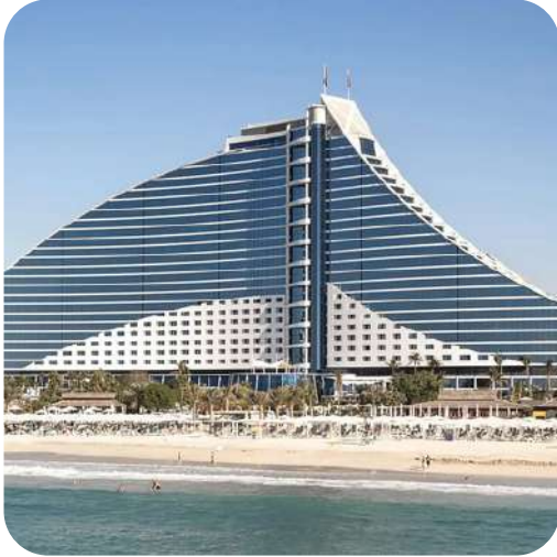
Jumeirah Beach Hotel, Dubai, UAE