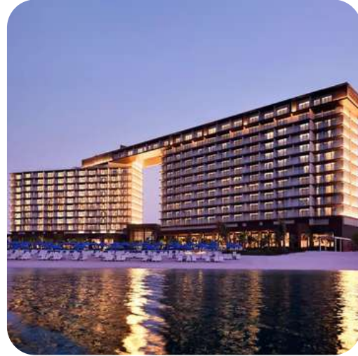
Mövenpick Hotels & Resorts, Dubai, UAE