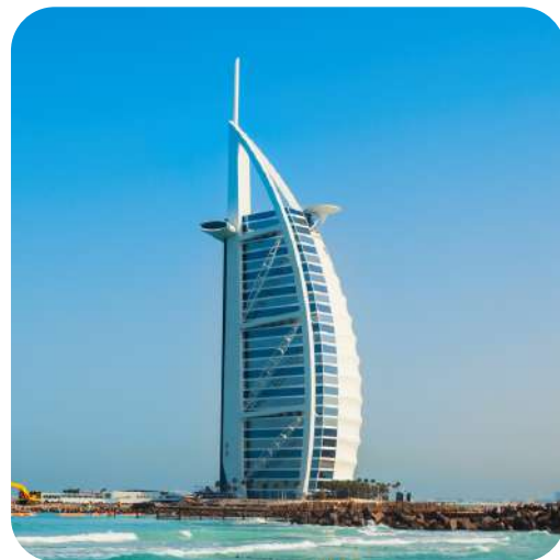
Burj Al Arab, Dubai, UAE

Wooden door panels, melamine faced boards, HPL (made in Germany)