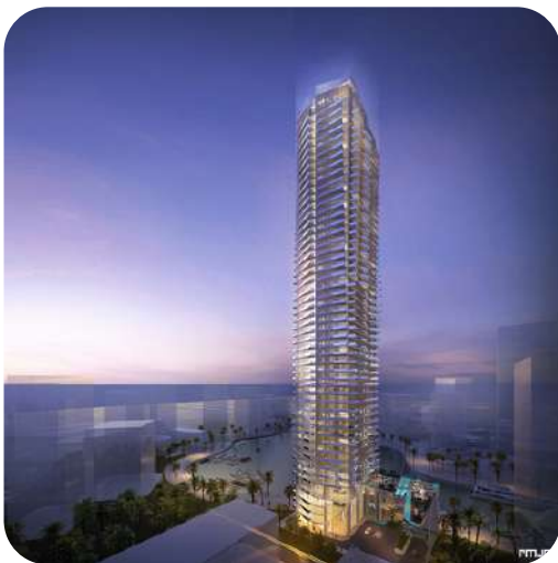
Stella Maris commercial & residential Buildings, Dubai, UAE

Drywall construction machines (made in Austria)