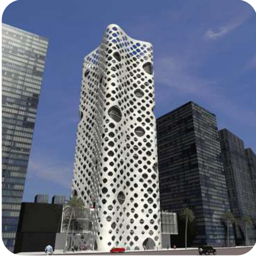
O-14 Tower, Dubai, UAE